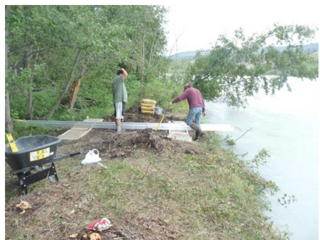
Figure 3. Preparing the Chilcotin Cantilever Wheel Site.

This aspect of the construction process could not occur until the water levels were close to in season levels as well as the ground being thawed to dig and build the foundation. So, as the fishwheels were going through final construction phases and adjustments at the UF-CFE shop located on the Williams Lake Indian Band Reserve aka Sugar Cane, the task of site preparation for the cantilever style fishwheel was carried out. Once the location was selected and surveyed and the position in the river that we wanted the baskets of the cantilever wheel to rotate at, we were then able to prepare the site, design and lay out the footings for the shore-based frame.