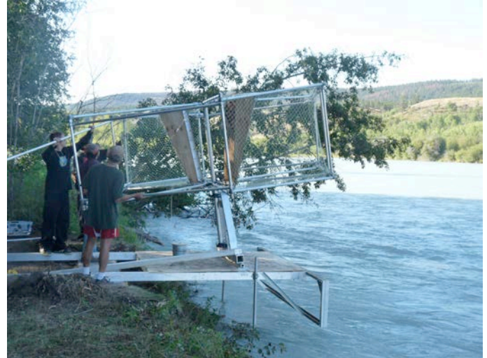
Figure 5. Making adjustments to the Chilcotin Cantilever Wheel.

regular practice that must be realized to ensure continuous operation.