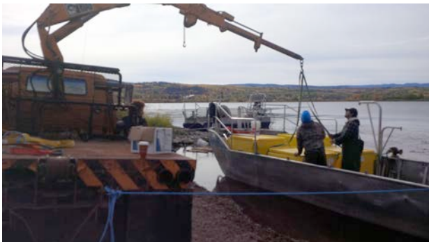
Figure 11. Unloading the Packer Boat - Knotty Buoy!

Once the packer boat was full, it would make its way to shore, where the totes that have been validated would immediately be loaded into a refrigerated unit. Those that were not validated would be done on shore, prior to loading onto the reefer unit.