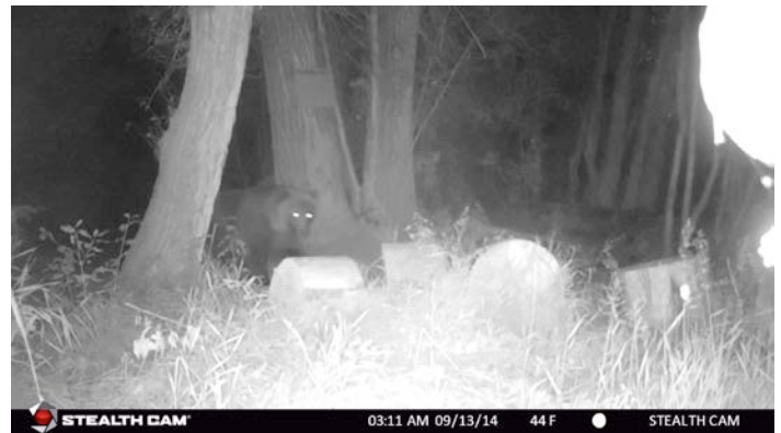
Figure 6. Visitor to the Fishwheel!

Further testing of the cantilever fishwheel with modifications and refinements would be worth looking into. With the majority of the work completed at the site of this fishwheel, labour and materials and supplies would be necessary to test the wheel for a full season. This would allow time to truly assess the viability of the cantilever type fishwheel for use on the Chilcotin River. It is known from 2014 that that there was some fish loss from the live box due to night time visitors, eliminating access to the live box and adequately covering the live box may deter some of the visitors from helping themselves to the fish captured as the wheel spins unattended.