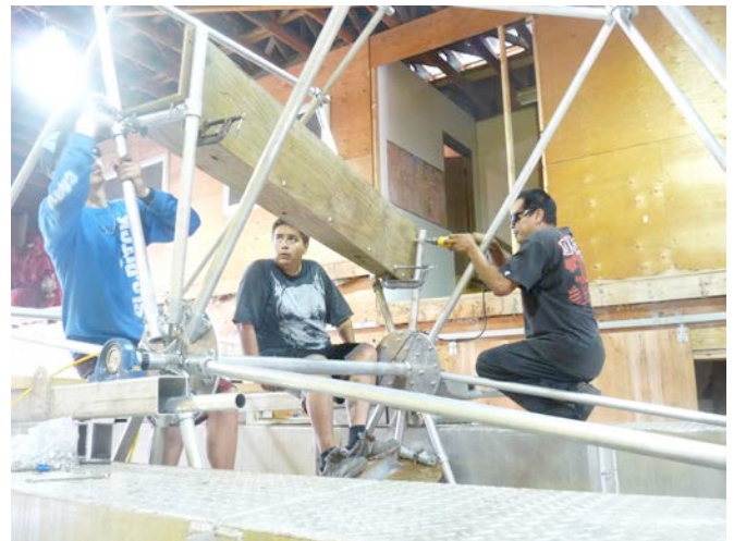
Figure 2. Working on sliders.