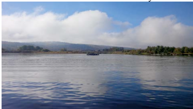
Figure 8. Seine Site on Fraser Lake. Stellako River in Background!

The location for this fishery was immediately identified to be in Fraser Lake, at the outlet of the Stellako River into the lake. Reasons being were that the fish were observed holding in the lake at the outlet, it was suitable for seine fishing method and the location of a landing site was located a short distance away.