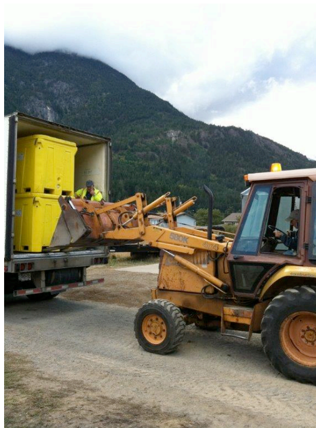
Figure 14. Loading a Reefer Trailer!

Additional nets were purchased in the event that equipment wore out or needed repairs and harnesses were supplied for Dipnetting as well as ropes.