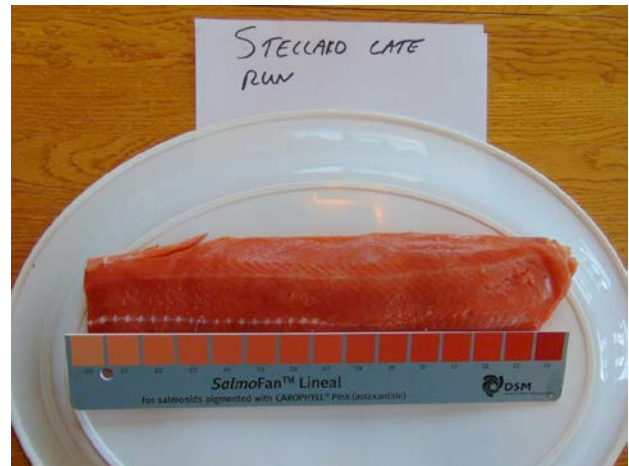
Figure 12. Fraser Lake sockeye blush test!

It should also be noted that a quality assessment was performed on this harvest and it is indeed suitable for most products that we are promoting.