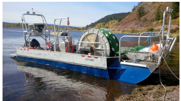
Figure 7. PICFI Seine Boat on Fraser Lake.

In 2014, the UF CFE was challenged to implement an economic demonstration fishery in the Cariboo-Chilcotin Region due to the Mt. Polley disaster. Leadership from the area was reluctant to endorse a fishery of any type – s.35 let alone an economic demonstration fishery. While the issue was being deliberated, the potential to implement a fishery in the Upper Fraser region was being realized.