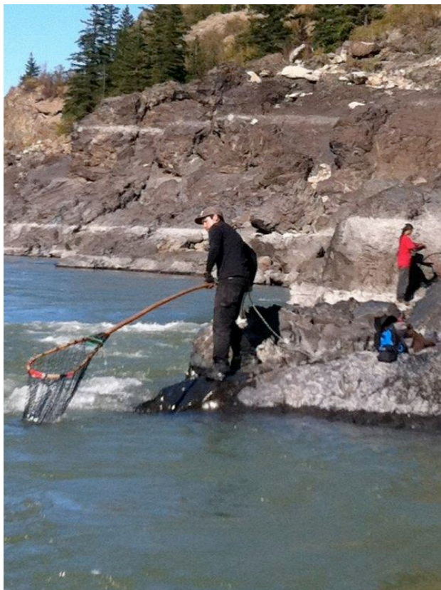
Figure 13. Dipping on the Fraser near Siska!

The sites that were chosen for fishing are the Siska Band traditional fishing sites along the Fraser River mainstem and are used each year by the members for their s.35 fisheries. Access to those sites was from Frenchman's Bar via a Jet Boat and foot access.