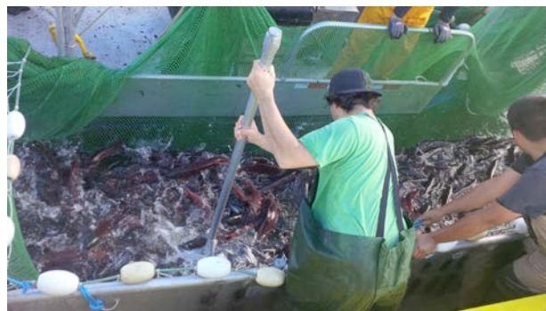
Figure 10. Brailing the Catch!

The by-catch was released by hand and with small trout dip nets. It should be noted that one set that was made was entirely whitefish and suckers. This net was immediately dropped and the fish were allowed to swim away from the boats, unharmed. An approximate estimate of that set with by-catch is 2500.